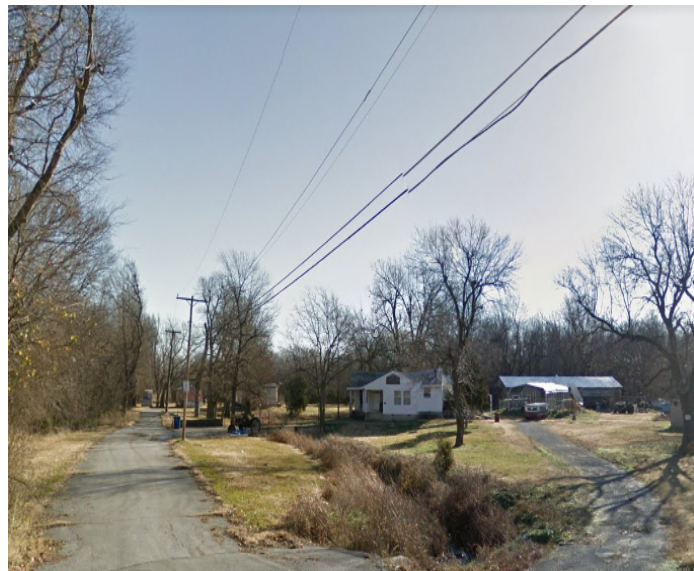
The properties of RLA #37 all lie within the 100-year floodplain of Flat Rock Creek.

The six properties of RLA #37 are situated in the lower Flat Rock Creek drainage along W. 49 th St. N. and W. 51 st St. N., west of Lake Yahola and U.S. Hwy 75. The terrain of the RLA is flat floodplain with no storm sewers and only shallow bar ditches for drainage. The properties lie within the 100-year floodplain of Flat Rock Creek at an elevation of between 595 and 604 feet. The SFHA in this area reaches to the 606-ft contour. Two properties, but no structures, are within the creek’s floodway.