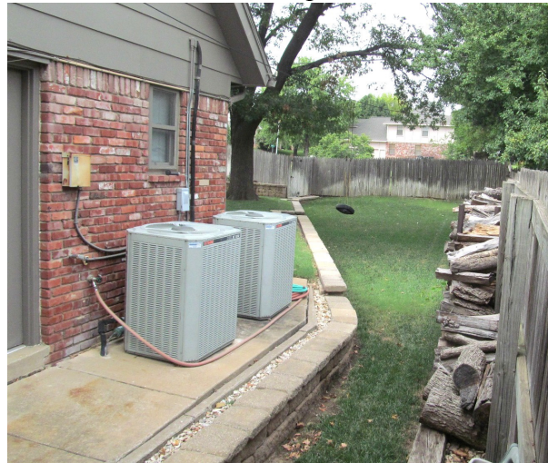
This platform and wall protect the home and air conditioning equipment from shallow flooding.

Know and Understand Your Flood Risk. As stated above, being located in a Repetitive Loss Area does not mean a property will flood. Nevertheless, it is important that residents and property owners in flood hazard areas know and understand their flood risk and take what steps they can to protect their homes, families and possessions. City staff is available to explain the local flood risk, interpret floodplain maps, and determine if an area or property has drainage problems or a history of prior flooding. Staff can also discuss the ways a specific property can be protected from flooding. An Elevation Certificate can help define a property's flood risk under various rainfall scenarios (e.g., in a 10-year, 50-year, 100-year, or 300-year storm). You can receive a free flood zone determination by contacting the City with the correct legal description and street address, or the Tax Assessor/Parcel Number of the property.