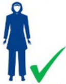
Religious swimwear such as Burkinis