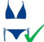
Bikinis (including tankinis)