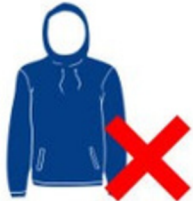
Jackets or hoodies