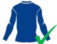
Rash guards or surf wear