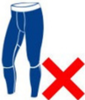
Compression pants and shirts