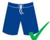
Board shorts or swim trunks

Swimwear for females must sufficiently cover breasts, genitals and butt. Swimwear for males must sufficiently cover genitals and butt. See additional coverings approved over acceptable swimwear below: