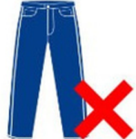
Denim, khakis or sweat pants