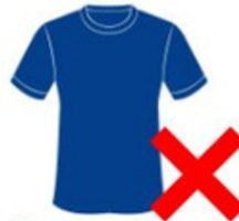
T-shirts and jerseys