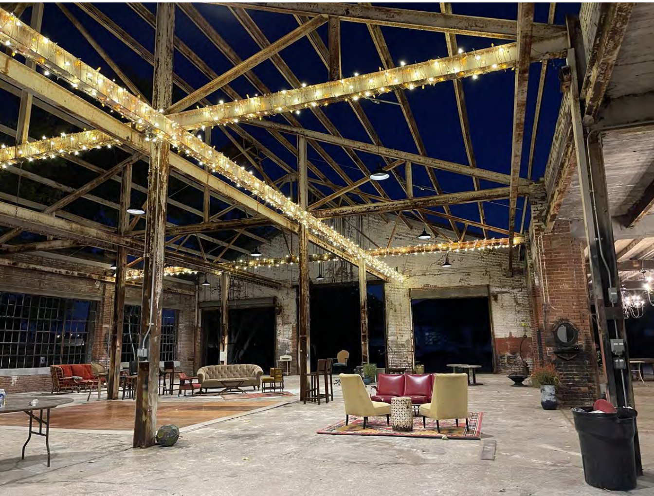
View from mid-room outdoor stage area