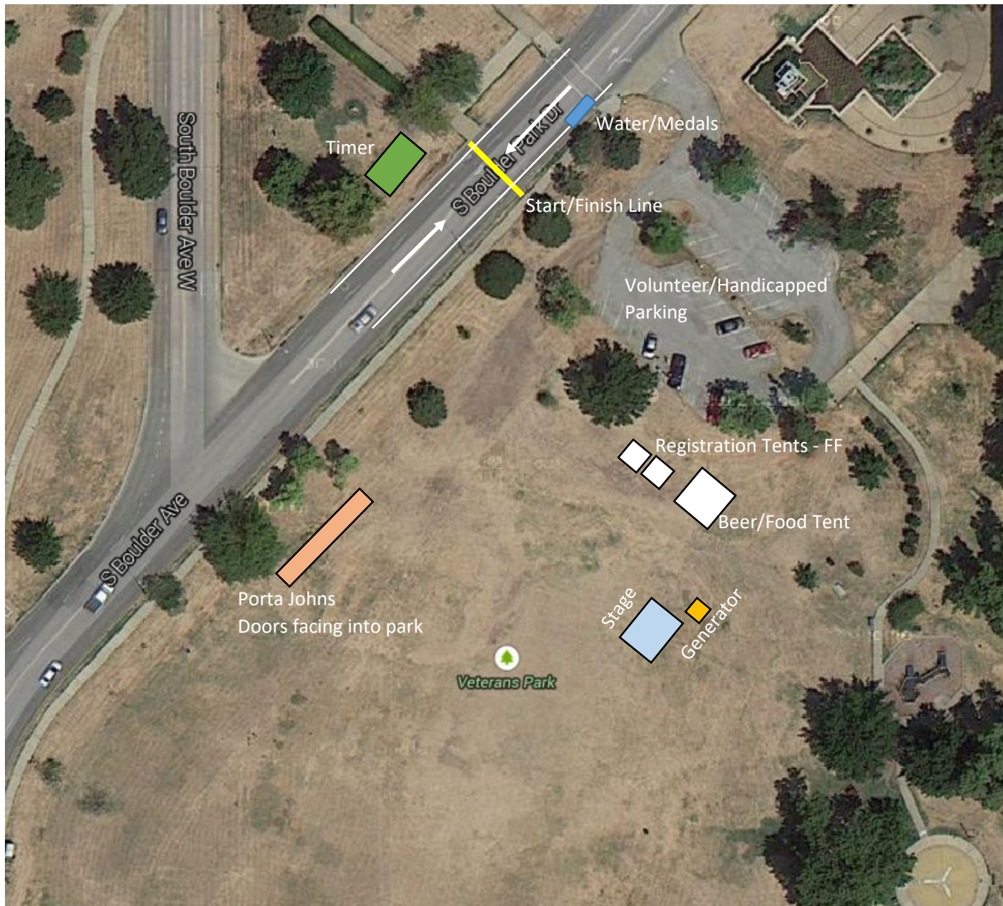
Cinco de Mayo Run Setup Map May 6, 2022