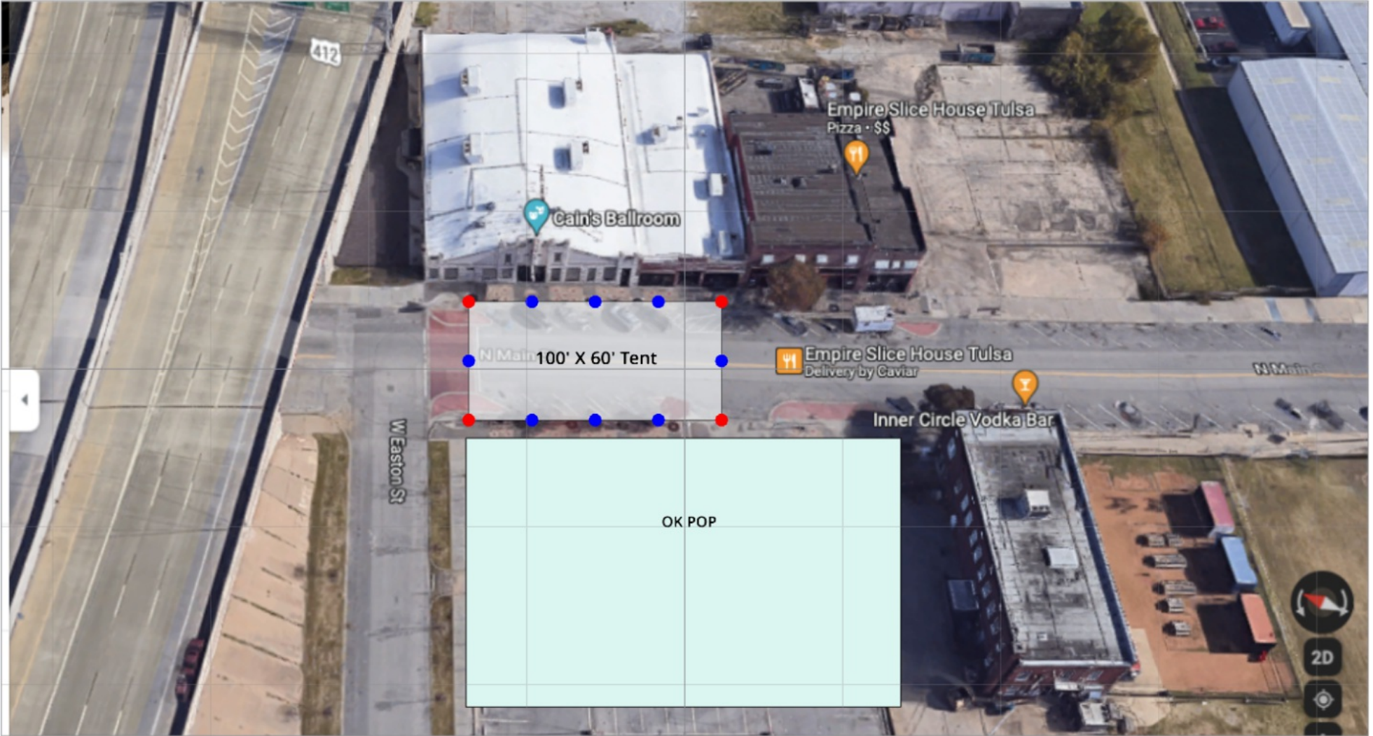
100' X 60' Tent - Cains Ballroom for Bob Dylan VIP Donor Dinner - Cains - May 4, 2022, 6:00 PM