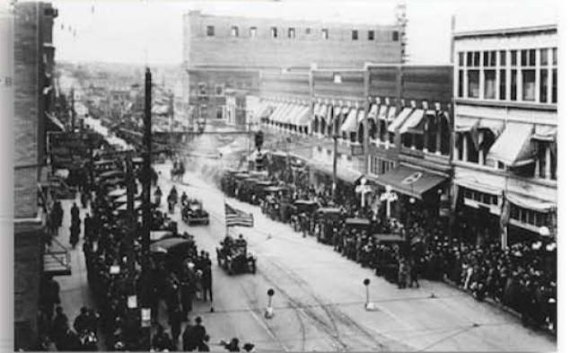
TULSA'S 1921 RACIAL MASSACRE DESTRUCTION